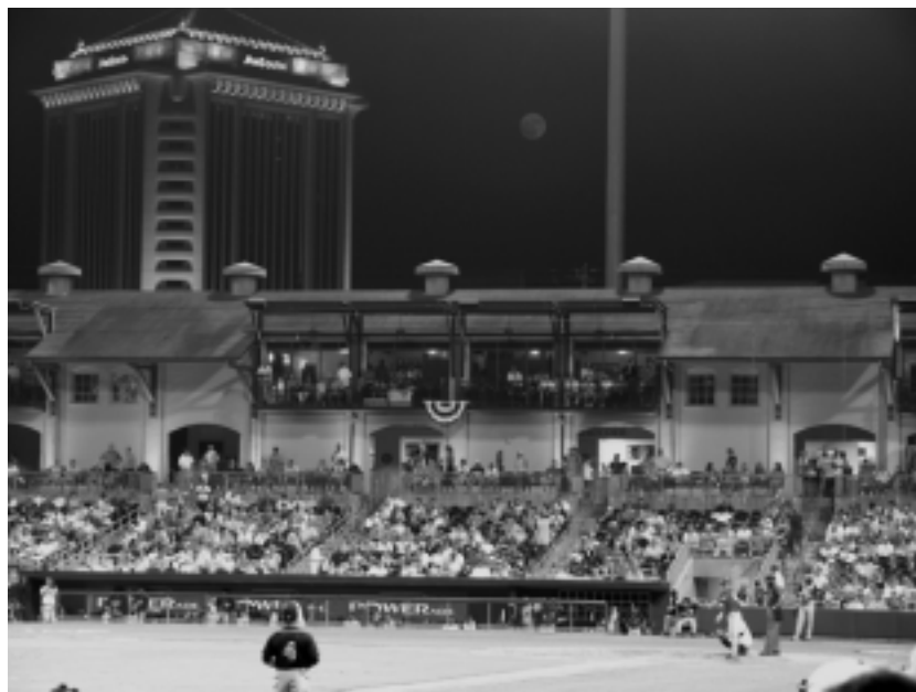
Left: Montgomery's Riverwalk Stadium. Bottom: RSA Battle House Tower in Mobile, under construction.