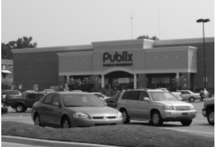
This Publix supermarket is built on the site of a former gas station.

As part of the VCP, ADEM operates the Alabama Land Recycling Revolving Loan Fund Program. Low interest loans are available to qualified local governments and nonprofit agencies for cleanup of contaminated properties owned by local government applicants.