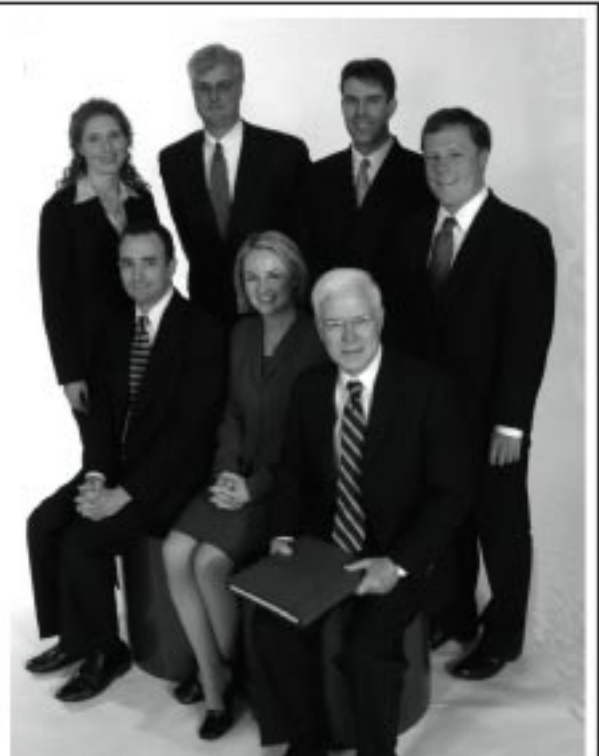
MUNICIPAL AND PUBLIC FINANCE GROUP

In accordance with the Alabama State Bar requirements, no representation is made that the quality of the legal services to be performed is greater than the quality of legal services provided by other lawyers.