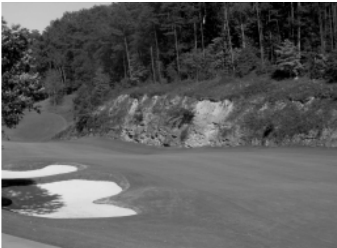
The Old Overton Country Club's golf course is built on a former Drummond Coal strip mine site.

ADEM has several programs to assist local governments with redevelopment of brownfield sites. The Voluntary Cleanup Program (VCP) is a cost-effective mechanism for aiding developers, consultants, industry and local governments in the assessment and remediation of brownfield sites. The program operates on a fee driven basis and the intent is to provide oversight for assessment and cleanup activities at brownfield sites. This oversight ensures remedial efforts are protective of human health and the environment.